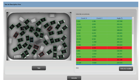
Component identification interface

Compatible with RC 5.16 B2 CN 6.X CPU 945 or 1000