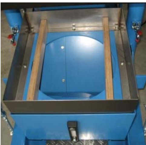
Honing liquid reservoir

Each honing head can be easily set to the required honing diameter by inserting spacers between the central shaft and the stone pressure actuators.