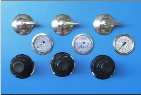
Central control panel.